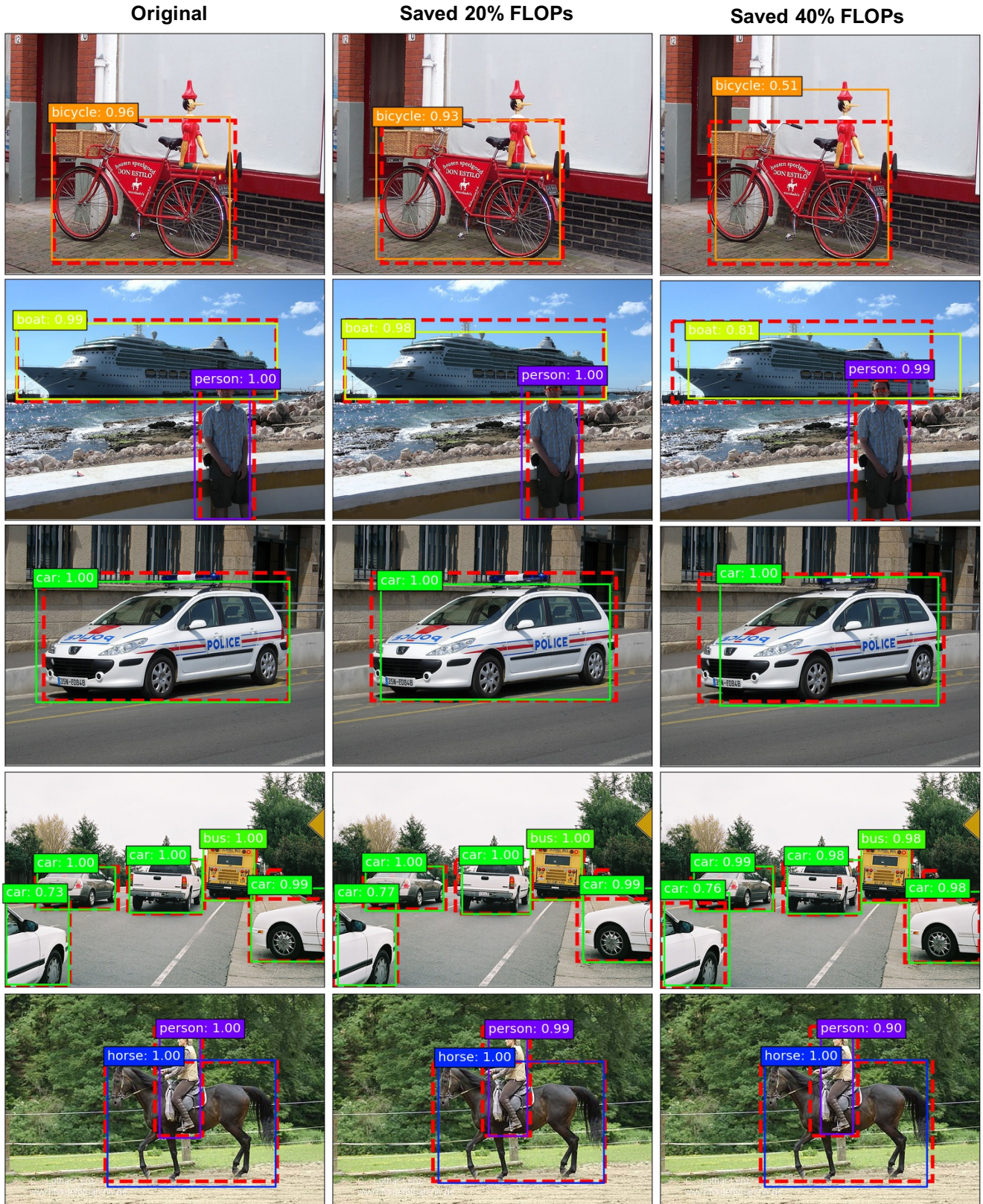
Figure 2. Visualized results of object detection on PASCAL VOC2007 dataset. The results are generated by using the original model, DL+FL Rank7, and DL+FL Rank5 from left to right.